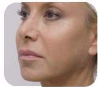
After four months

Here are some great before and after pictures from Sinclair Pharmaceuticals.