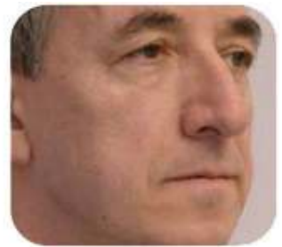
After one month